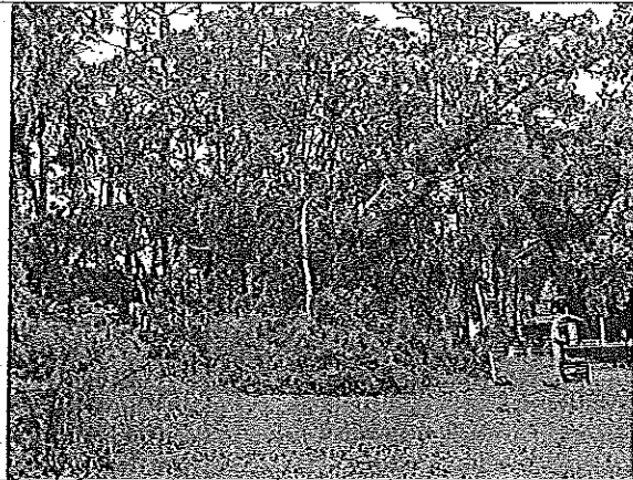
House on mound site as viewed from project site property