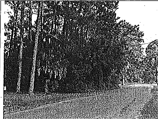
Clark Street with mound site