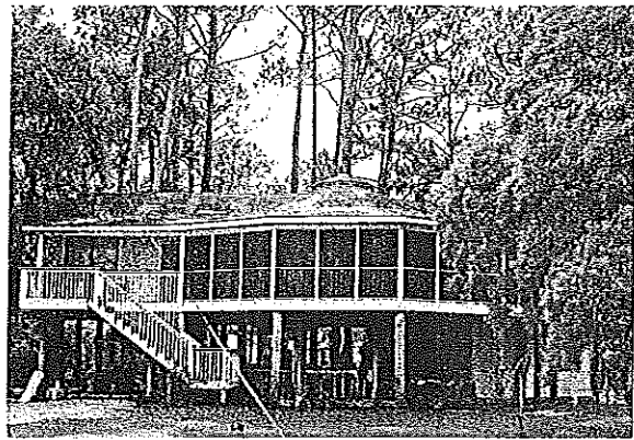
Project site house sites on lot adjacent to Crum Drive